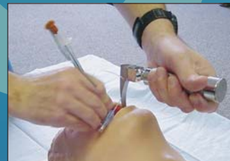
After intubation . . .

Statistics: Descriptive statistics were calculated, as were the sensitivity, specificity, accuracy, and 95% confidence intervals.