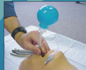
Complete re-inflation indicates tracheal intubation.