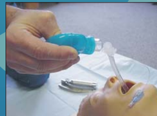
the EDB is deflated and attached to the endotracheal tube.